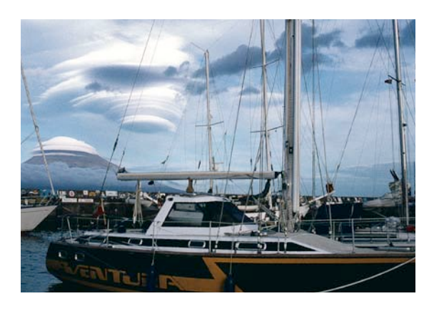
Could this be an extraterrestrial craft about to land?

I still look at the sky and clouds, see that some are white and others grey, some large, some small, some fluffy, some ragged at the edges, trying to guess what they may be telling me.